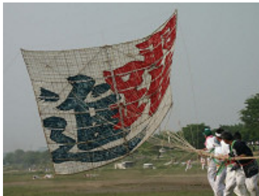
2003 " yakushin "