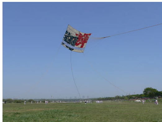
2005 " kisyo "