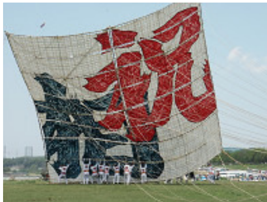
2004 " syukuso "